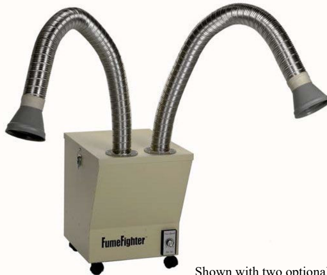
Shown with two optional arms