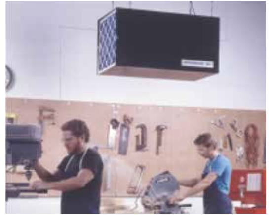
The M67 cleans wood particles and dust from wood shops.

Does not meet California air cleaner regulation requirements; cannot be shipped to California.