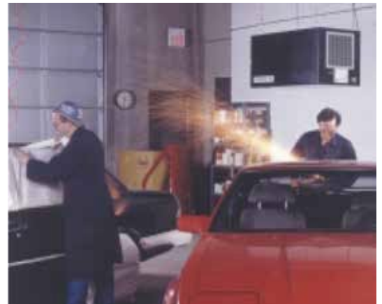
The M67 is perfect for autobody shops.